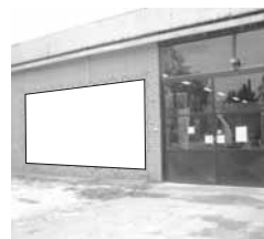
Banner 5 x 3 m