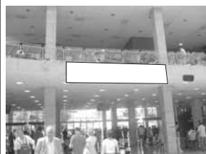
Banner 5 x 1 m