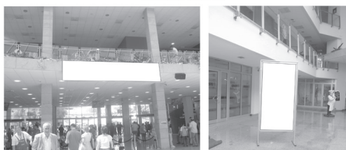
Banner 5 x 1 m