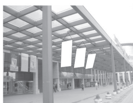
Flag 1,5 x 3 m

SPONSORSHIP PACKAGES AND OTHER PACKAGE OF MARKETING SERVICES ARE CHARGED BY SPECIAL OFFERS. PHONE + 381 21/483-11-25