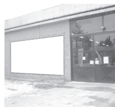
Banner 5 x 3 m