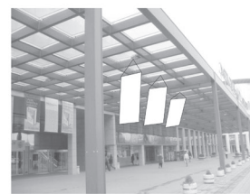
Flag 1,5 x 3 m

SPONSORSHIP PACKAGES AND OTHER PACKAGE OF MARKETING SERVICES ARE CHARGED BY SPECIAL OFFERS. PHONE: + 381 21/483-11-25.