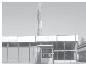
Banner 3 x 1,5 m