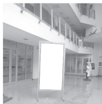
Board 1 x 2 m